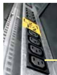
High-performance power supply