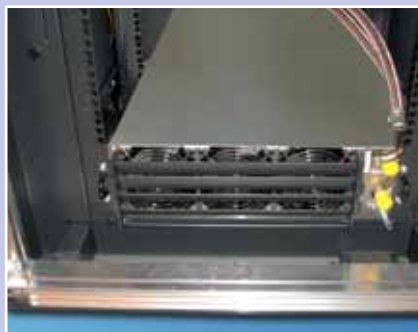
CoolTherm® 4-8 kW for low heat loads