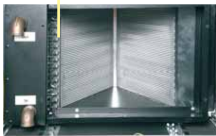
V35® high performance air-to-water heat exchanger

The impressive Knürr CoolTherm® technical concept: Closed air circulation with V35 air/water heat exchanger. The dissipated heat is therefore not given off as an additional load on the IT room (as is usual). Connection is made installation-friendly to a building or rack-own cold water system. Operation and service are performed with no difficulty whatsoever. (Smaller cross-section shown)