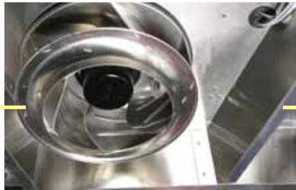
Optimum ventilation, temperature-dependent and speed-controlled