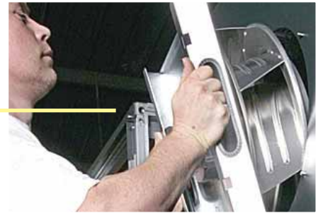
Easy fan exchange while doors remain closed