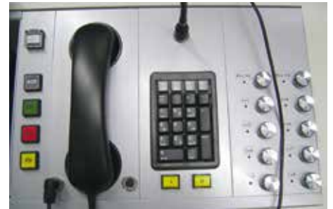
Console pod for modular front panels