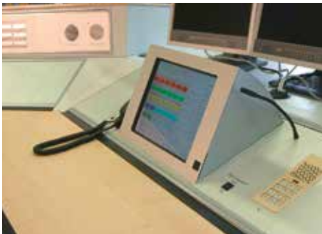
Tilt adjustment for built-in monitors