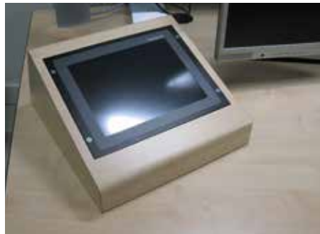
Tailor-made display integration