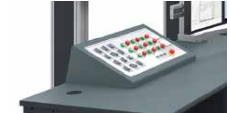
Console pod for modular front panels