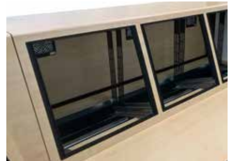
Console pod for 19" front panels