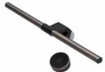
Screen Bar Halo