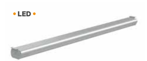
Knürr Smart LED