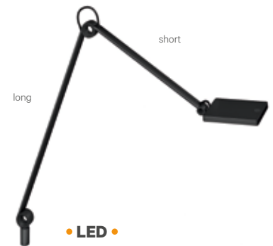
Knürr Task LED L