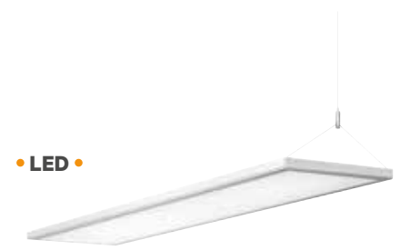
Knürr® Console LED pendant