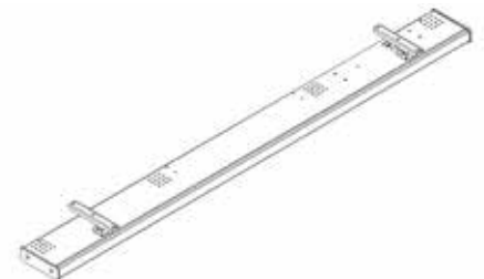
Workstation lamp (underfit)