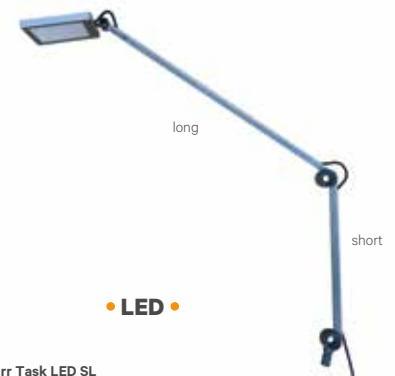
Knürr Task LED SL