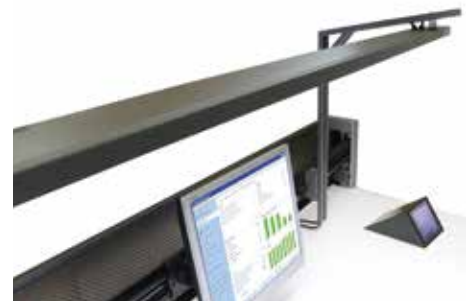
Knürr Lumax LED Lamp