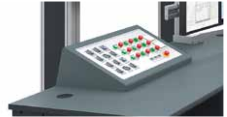
Console pod for modular front panels